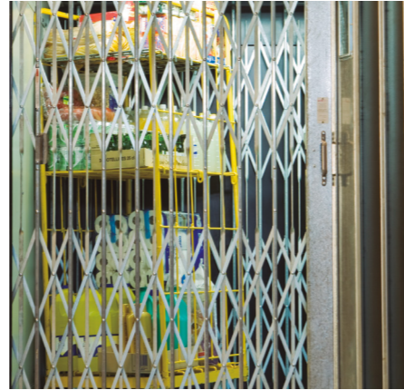
Lift car folding doors: manual picket gates