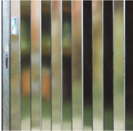
Lift landing folding doors: manual shutter gates