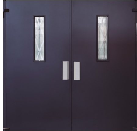
Lift landing doors: manual (standard)